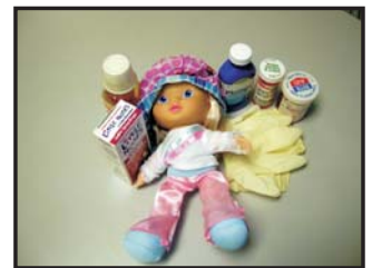
Training Materials Needed

If you have any questions feel free to contact MountainHeart Child Care Services.