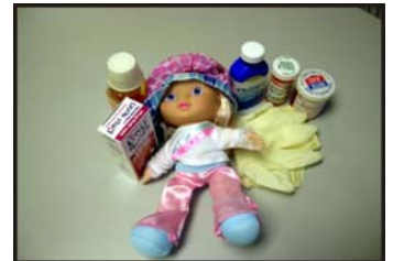
Training Materials Needed

Due to the intensity of the material to be covered you must be there at the scheduled start time of training. If you have any questions feel free to contact MountainHeart Child Care Resource & Referral.