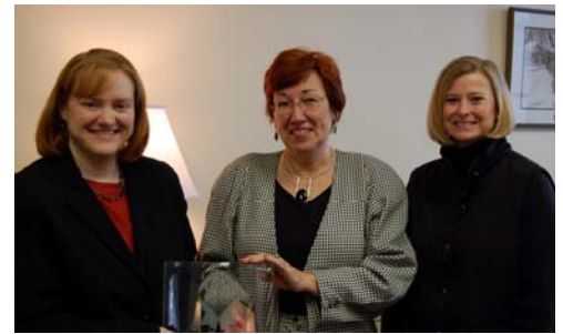
West Virginia Wesleyan College