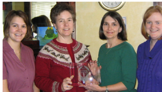
Youth Health Services, Inc.

Program Director. Other award winners are Davis and Elkins College, IRS in Martinsburg, and James Rumsey Technical College in Martinsburg, WV.