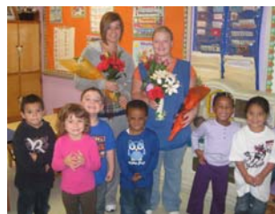
Norborne Day Care Center