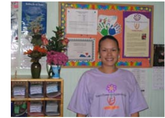
Little People Daycare