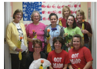
Little Bear Day Care, Inc.