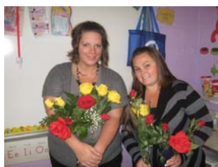
Norborne Day Care Center