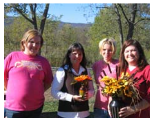
Keyser Wee Care

MountainHeart Community Services touched the people who are touching the future of our children by delivering flowers on October 19, 2010. It was the third annual “Take a Flower to Childcare Day.” West Virginia is dedicating this day to people who say “I am proud to be a child care provider.” We want to raise awareness about the important role that these special people have in the lives of our children and in the future of our state. The childcare providers of this state are making a difference in each of our children’s lives by wiping away tears, giving hugs, and making each experience a “teachable moment.” These special people are getting a once in a lifetime chance to touch the future!