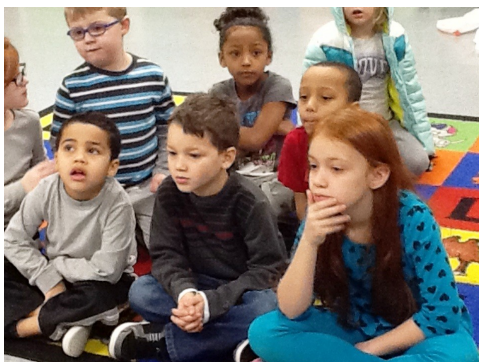
Dr. Sues story time at Little Feet Child Care and Preschool